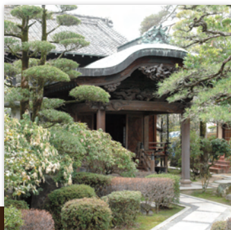
Choseikaku Villa Entrance

Another of its distinctive features is the sliding door paintings and other works of art that adorn the villa's interior, many of which were painted by artists who are among the most famous names in modern Japanese art.