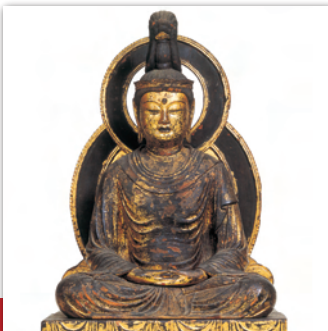
Seated Amida Nyorai By Kaikei (Important Cultural Properties)