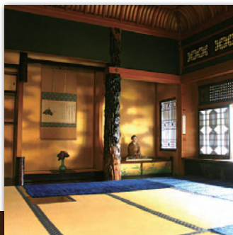
Choseikaku Villa Elder Room