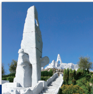
View of "Tower of Hope" from "Sky Cat"