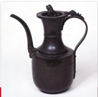
Shigigata Water Vase (Important Cultural Properties)

Within the grounds of Kosanji Temple, the works of art that Kozo Kosanji collected over a lifetime are on display in Pavilion No. 3 (Hohozo), Pavilion No. 4 (Sohozo) and Kongo Gallery. The collection features sculptures, paintings and handicrafts that are representative of Japan, including Important Cultural Properties and Important Works of Art, on permanent display or available for viewing as part of special exhibits.