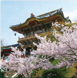
Kosanji Koyomon Gate and Cherry Blossoms