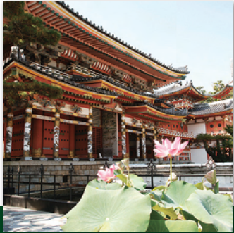
Kosanji Main Hall and Lotus Flowers