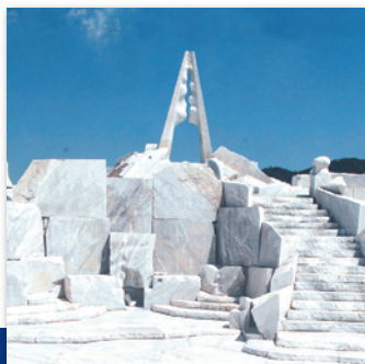
Tower of Hope

Designed and created over a period of 16 years by Itto Kuetani, a sculptor who is active in Italy, this marble garden was opened in October of 2000. Covering over 5,000m 2 and using around 3,000 tons of Carrara marble, the garden is filled with various monuments both large and small that incorporate the surrounding environment to achieve a remarkable harmony with nature. The theme of the garden is "Familial Ties" and it represents a peaceful world that is filled with hope for the future.